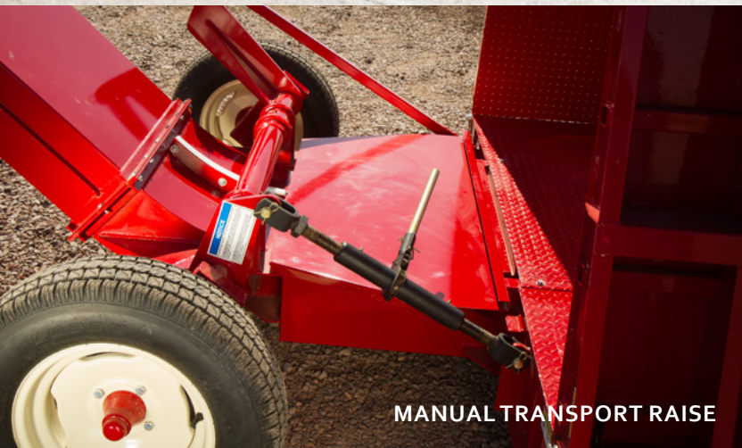
MANUAL TRANSPORT RAISE