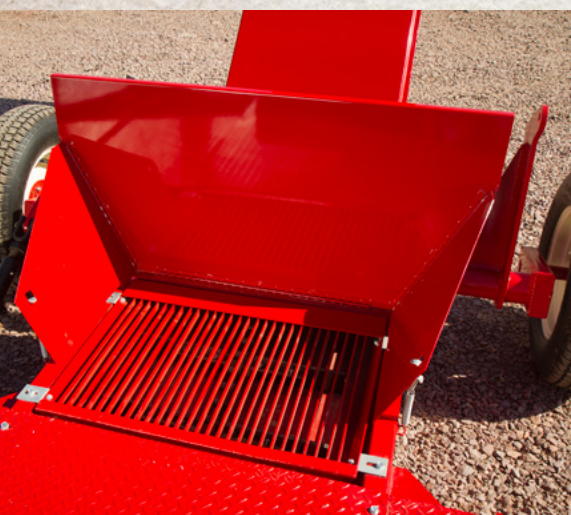
COLLAPSIBLE SPLASH GUARD