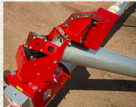
GREASE FITTING ACCESS