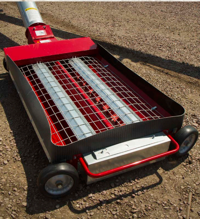
TWIN SCREW HOPPER