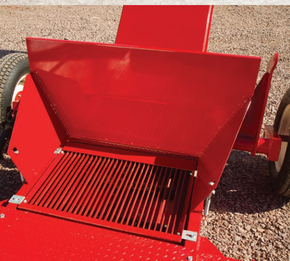
COLLAPSIBLE SPLASH GUARD