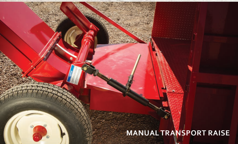
MANUAL TRANSPORT RAISE