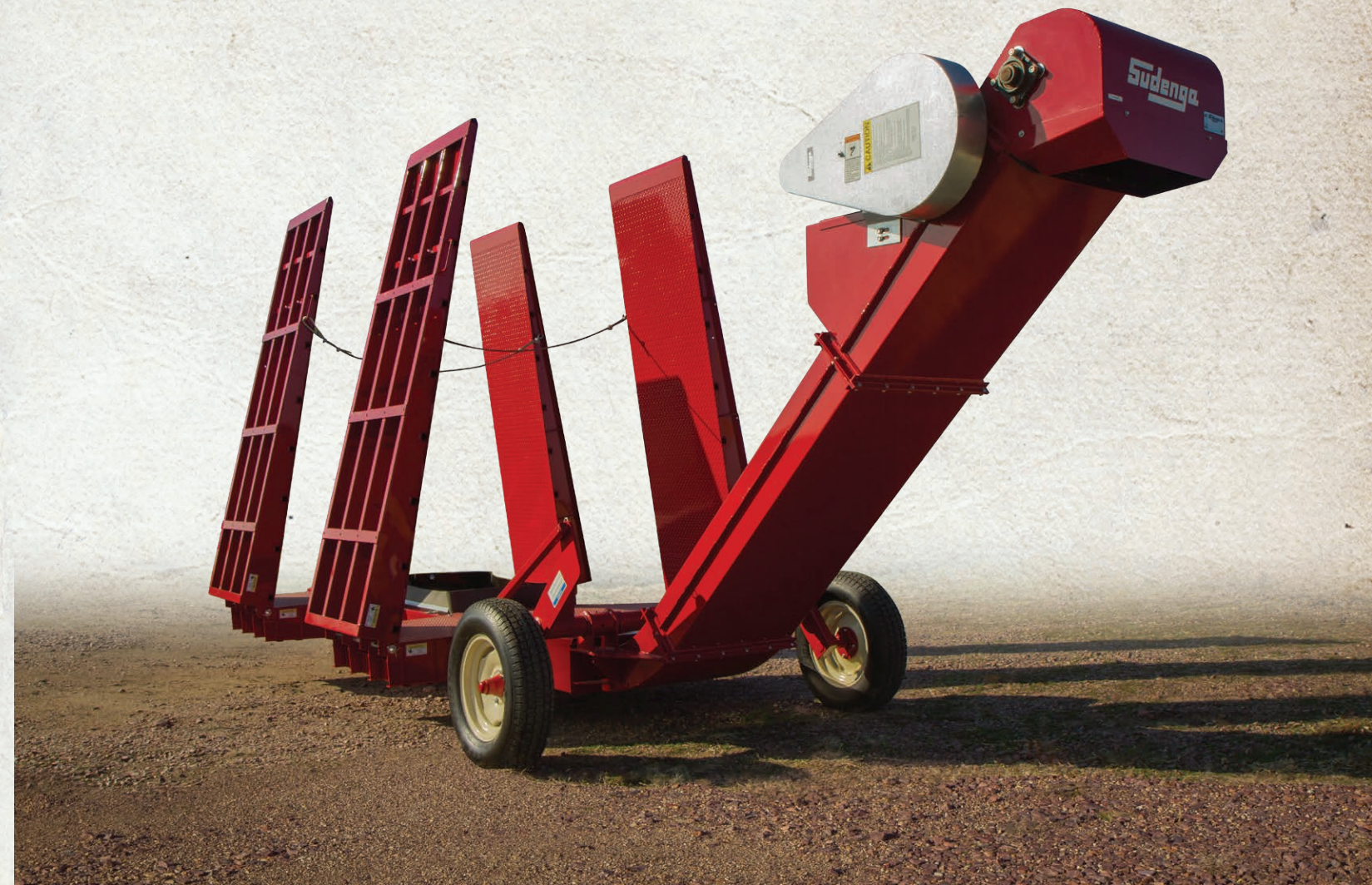
*SHOWN WITH OPTIONAL NECK EXTENSION